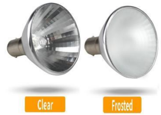
Clear & Frosted covers optional for AR56