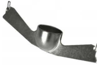
Metal cap reducing glare light