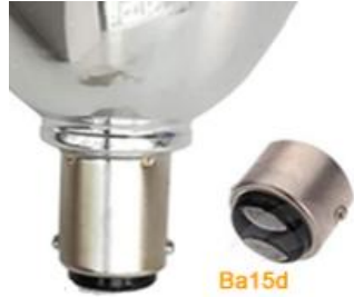
AR37, AR56 and AR70 Ba15d brass nickel base cap