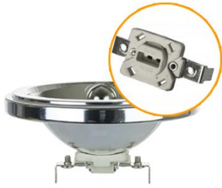
AR111 Ceramic part and G53 base cap